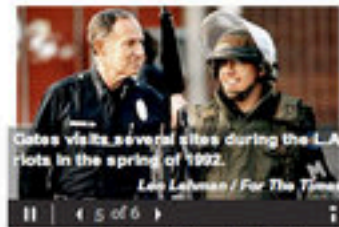
Gates visits several sites during the L.A. riots in the spring of 1992.

IN THE NEWS: GOLDMAN SACHS | VOLCANO | DARYL GATES | UNEMPLOYMENT | KINGS-CANUCKS | COACHELLA